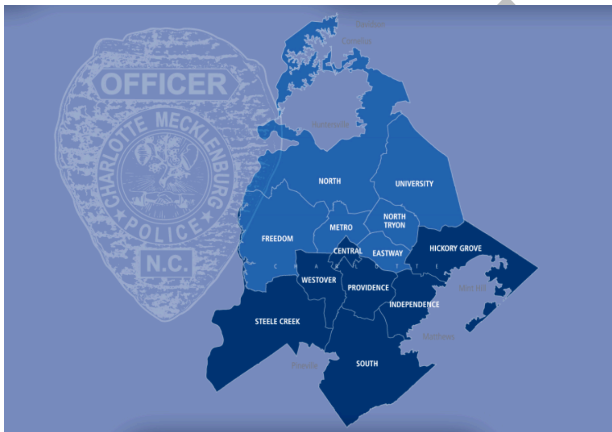
Figure 1: CMPD Patrol Divisions

Investigative Services, and Support Services. 188 The Field Services Group is separated into Field Services North and Field Services South—each led by a deputy chief—and further divided into 13 geographically-arranged patrol divisions (depicted in Figure 1). 189