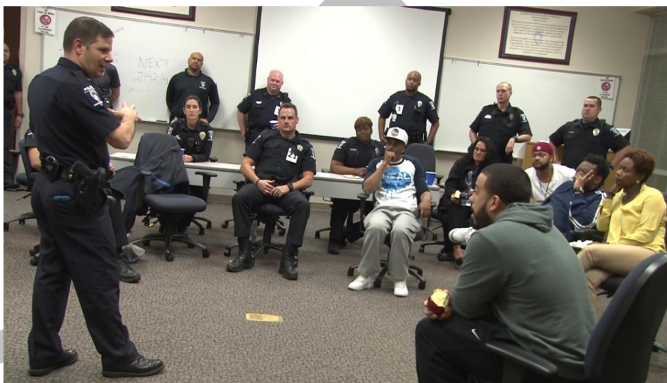
CMPD CCT Training with community members.

the demonstrations—assigned to positions throughout the department and focused on enhancing interactions with community members, particularly in critical incidents, by combining classroom instruction and scenario-based training. The training instructed officers to actively listen to community members even if it involves withstanding some verbal abuse; to convey to the community member that they are actively listening and trying to connect; and to be able to provide community members with information and answers to their questions regarding CMPD policies, training, statistics, and other general questions asked. 98 Given the success of the CCT at other demonstrations and officer-involved shootings since September 2016, CMPD is requiring all sworn personnel to complete CCT training. 99